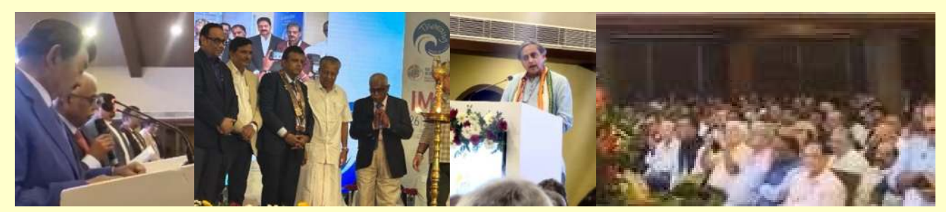
Installation ceremony, 28/12/2023

"THARANG" - All India Medical Conference 98<sup>th</sup> National Conference IMA was hosted by IMA Thiruvananthapuram Branch, Kerala on 26, 27 & 28 December, 2023 at KTDC Samudra (COK Rivera) and UDS Udaya Samudra (VCV Rivera), Kovalam, Thiruvananthapuram, Kerala. Highlights of the conference was socio medical and academic deliberations: