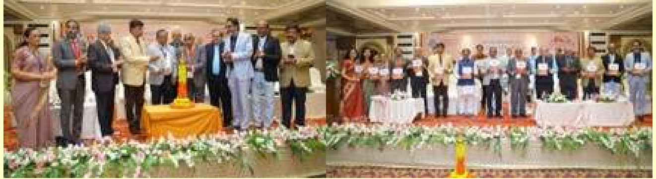
Inauguration of conference