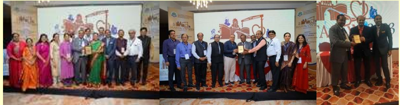
ENTERTAINTMENT PROGRAMME AND BANQUET, 25/11/2023