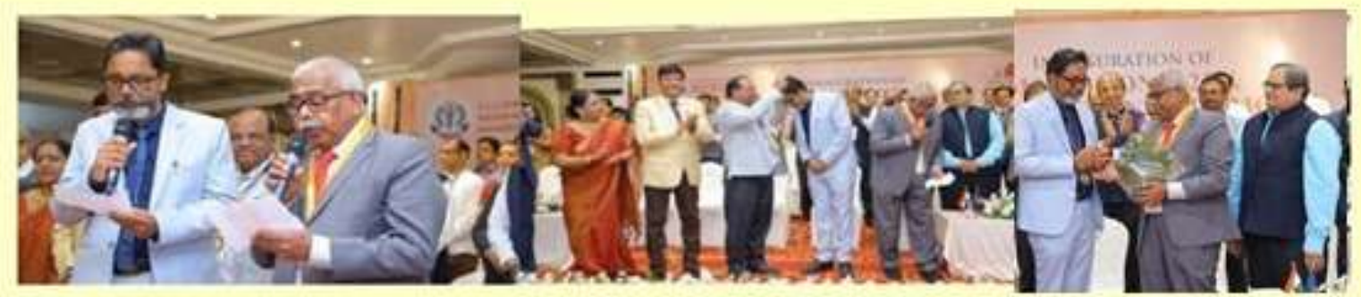
Change of guard