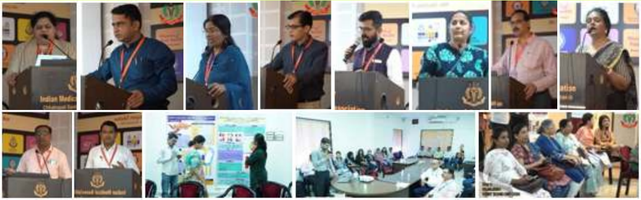
Preconference CME, Workshop, Poster and Paper presentations