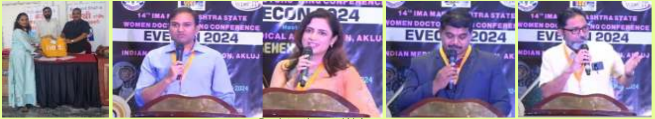
Registration & Welcome