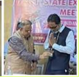
Office bearers on the dais