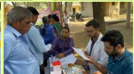
Vital health initiative