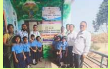
School health check up