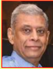
Dr. Ramesh Subramanian Editor

Food safety is an important issue in our country because of widespread presence of contaminated food and unsafe practices resulting in food borne diseases, health risks and even deaths. Food safety involves taking measures to properly handle, prepare, and store food in order to prevent contamination and ensure it is safe for consumption. It relates to identifying and managing hazards that affect the safety of food, such as microbial contamination, chemical residues, and physical hazards. The various aspects of food safety are discussed in this edition .