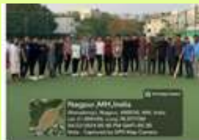
Mix cricket match