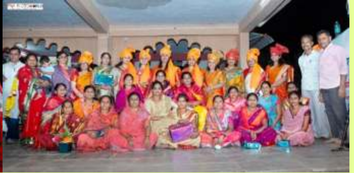
Health minister Khel Paithanicha