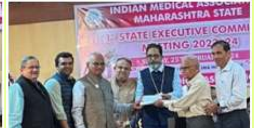
Presentation of report