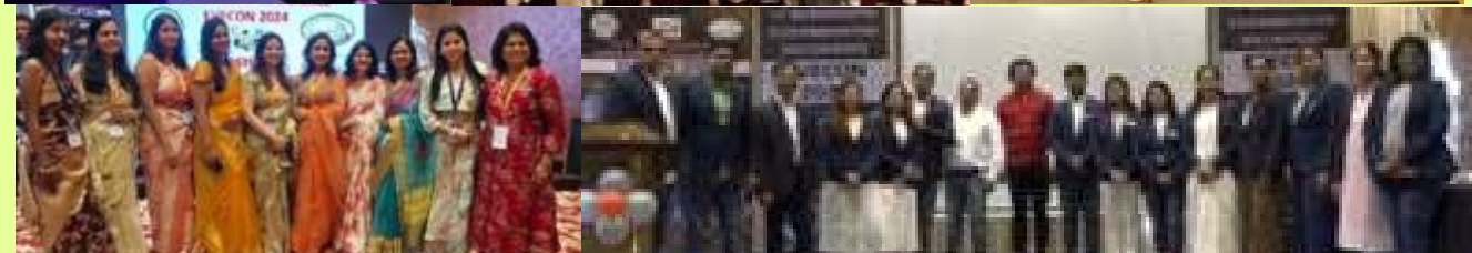
Cultural programme, fellowship