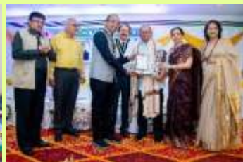
IMA Mumbai West