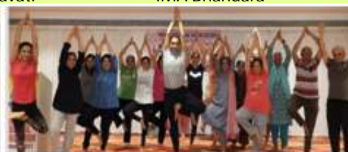
IMA Mumbai West