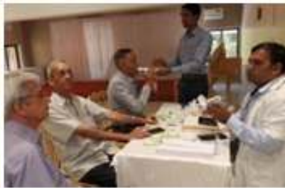
Peak flowmeter testing of delegates