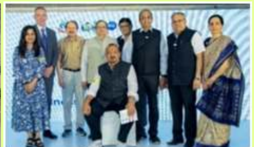
'Path to recovery' programme