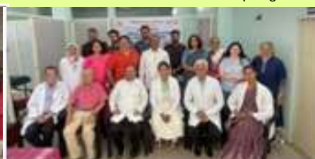
Health checkup camp