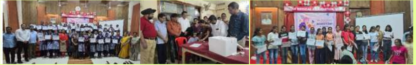
Gundewadi village Marathi school