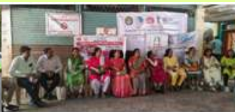
Public awareness programme