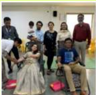
Blood donation drive