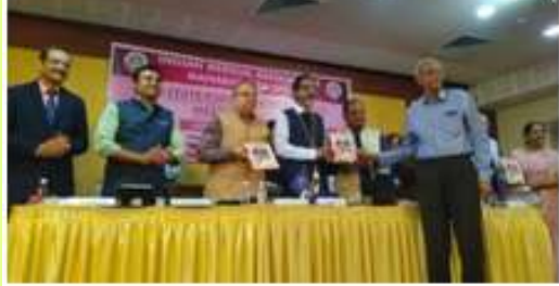
Release of MAHIMA