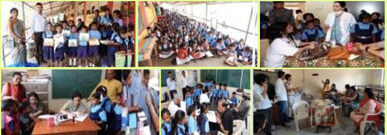
School health check up