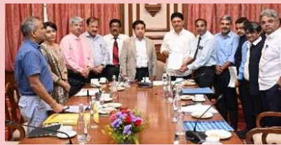
Health Minister Shri Prakash Abitkar