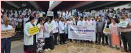
IMA Ch. Sambhajinagar