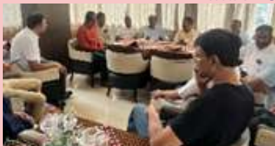
Visit of IMA MS team for inspection