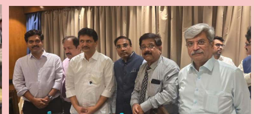
Meeting with Health Minister Shri Prakash Abitkar