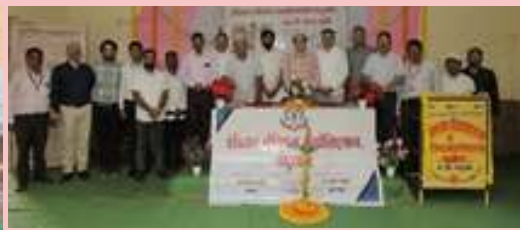
Mamta school, Village Dhanora