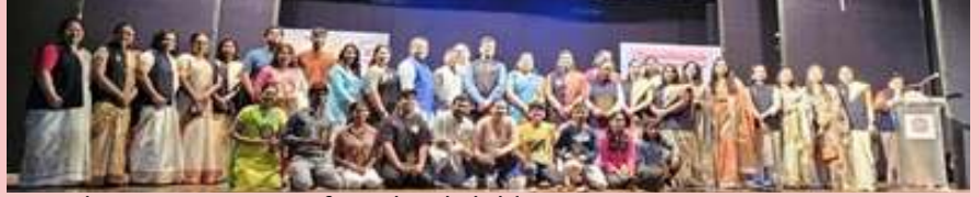
Career Guidance programme for school children