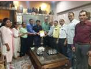
Shri Sanjayji Sawkare, MLA Bhusawal, Textiles Minister