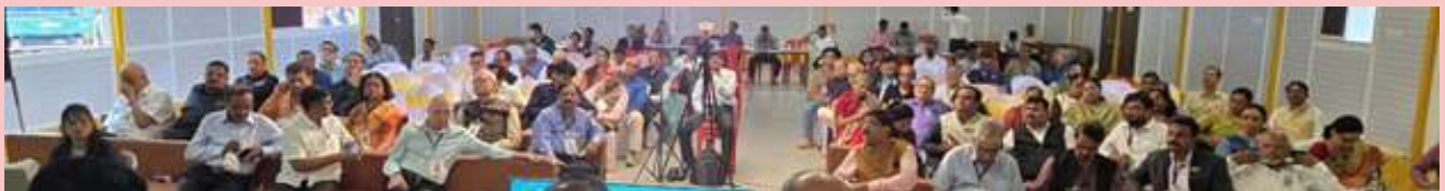
Panoramic view of the delegates