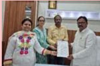
MP Shri. Balvant Wankhade