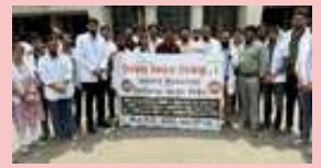
MARD, GMC Nagpur