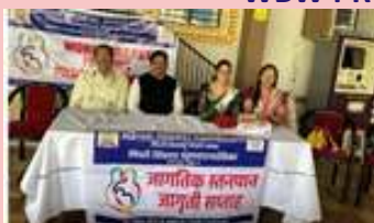
IMA WDW Chandrapur