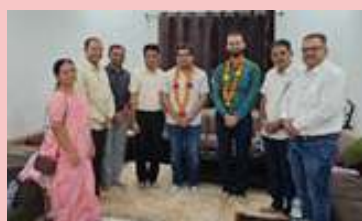
New office bearers