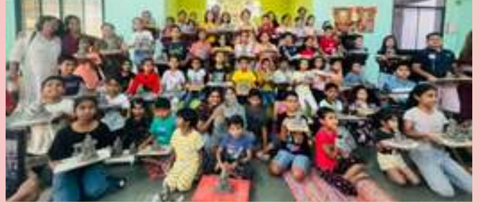
IMA WDW Ahilyanagar