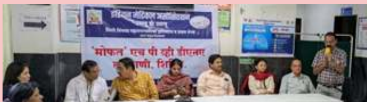
Free HPV DNA PCR testing camp