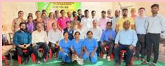
Village Zanzuri near Palghar, 17/8/2025, 150 beneficiaries