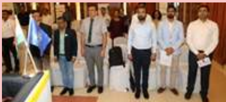
Multispeciality monsoon meet