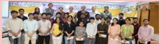
Teachers' Day, Merit Scholarship to students