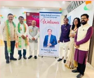
Sambhajinagar Shri Babasaheb Patil, Minister, GOM