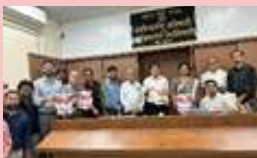
I MA Umerkhed