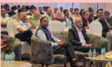
Fire Safety Conference