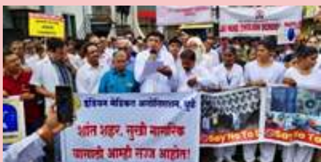
Silent march against noise pollution