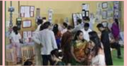
IMA Pandharpur: Art and craft exhibition by members