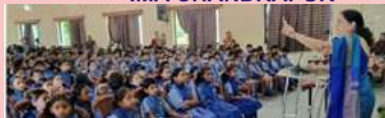
WDW - Mission Pink Health School - Health talks