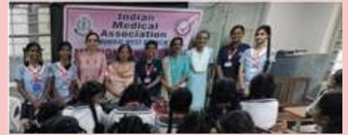
Mission Pink Health, St. Lawrence School, Santacruz, Mumbai