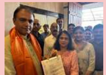
Shri Pankaj Bhoyar, Minister at Wardha