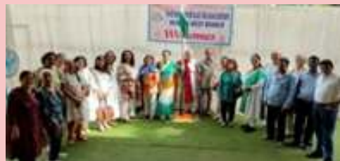
IMA Mumbai West