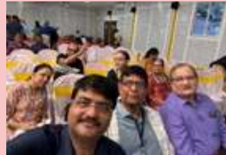
Section of the delegates