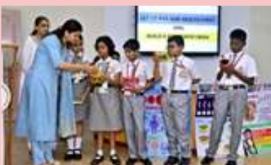
"Get Label Smart"* Campaign at Palod Public School