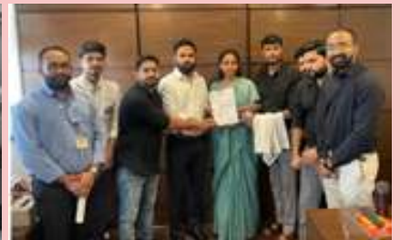
MP Mrs. Supriya Sule