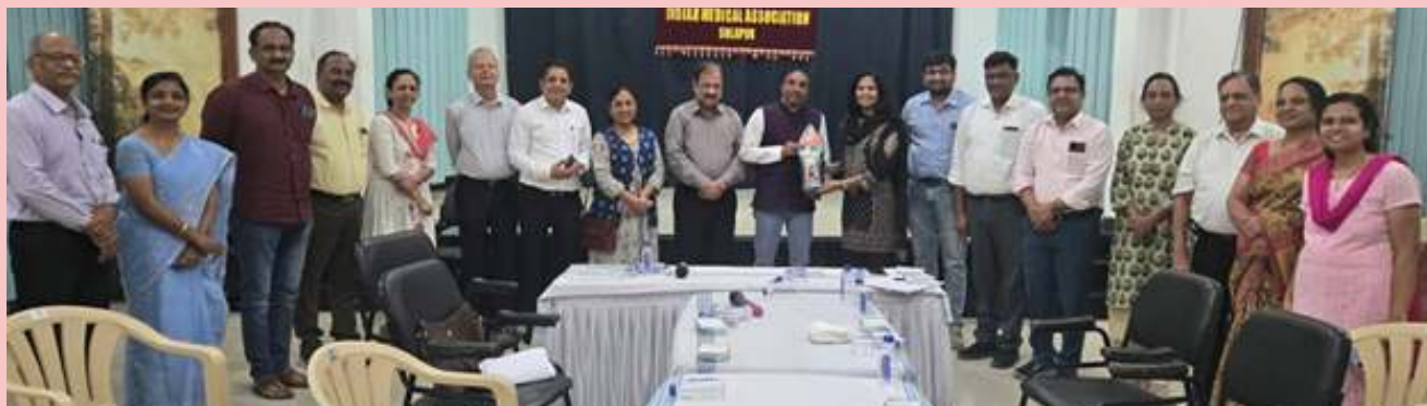
Visit to Solapur for preparation of MASTACON and Annual Council meeting