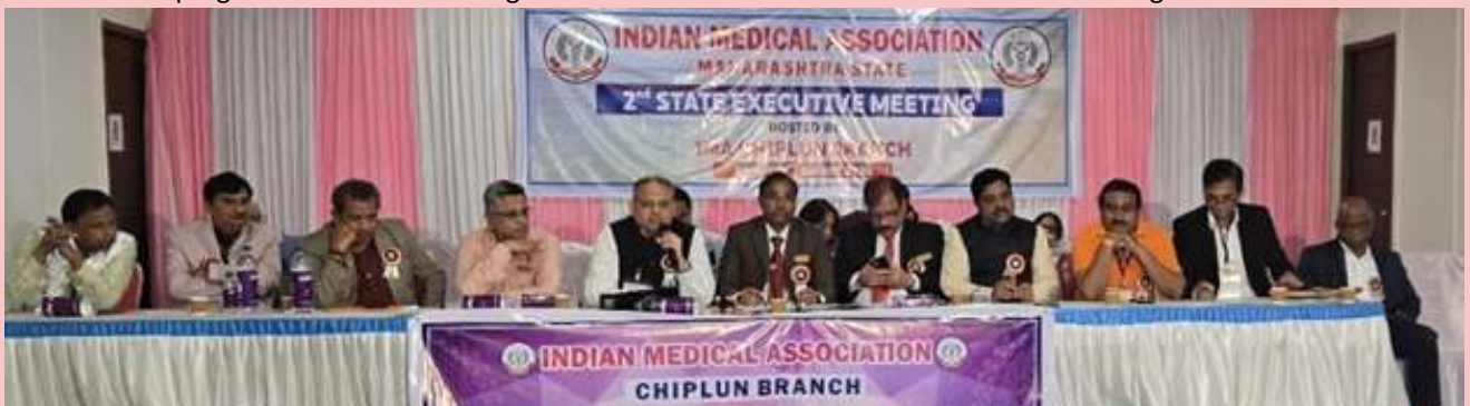
Meeting in progress