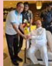
Shri Sharad Pawar