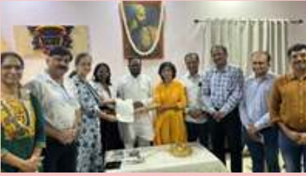
Mr. Anil Bonde, MP, Amravati