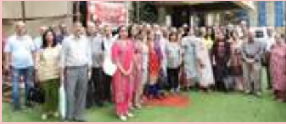
IMA Mumbai West