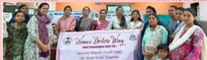
IMA WDW PCB