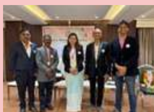
Installation of Obs