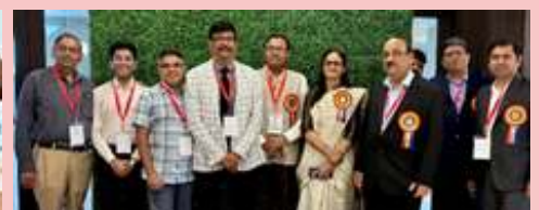
VIMAICON, annual conference of IMA Virar, 5/10/2025