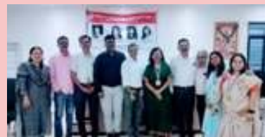
IMA Nashik Road