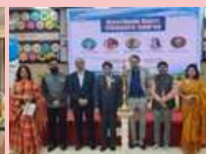
WEALTHCON investors course