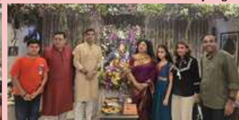
MP Dr. Shrikant Shinde