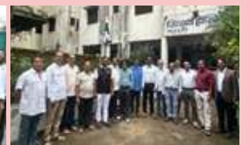
IMA Wai (Satara)