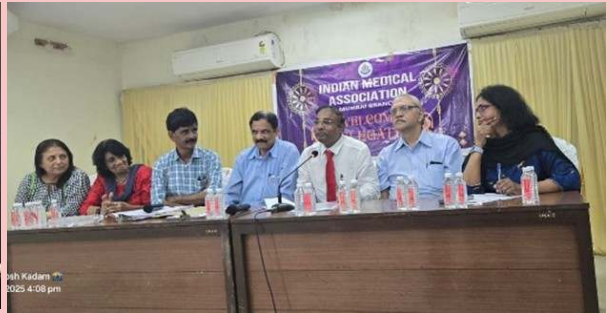
Visit to Mumbai Branch