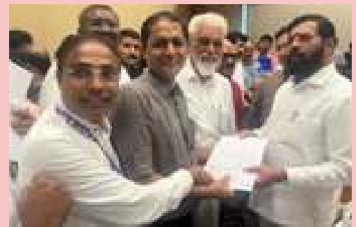
Hon. CM, Hospital Regn renewal