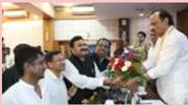
Dy CM Shri Ajit Pawar