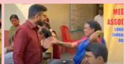
IMA CHH. SAMBHAJINAGAR - Health Camp, distribution of essential commodities