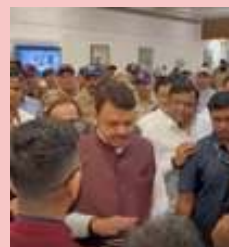
Hon. Chief Minister at Sambhajinagar