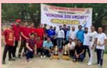
Monsoon box cricket